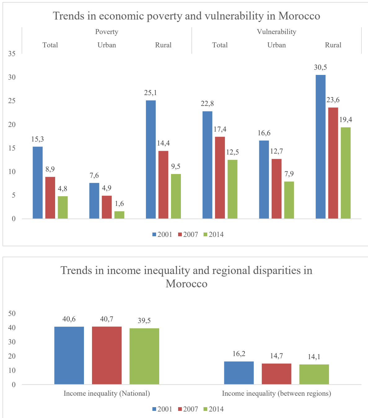
Figure 1: Evolution of poverty and vulnerability in Morocco